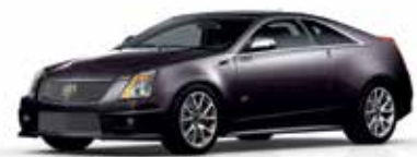
MAJESTIC PLUM METALLIC 1,3